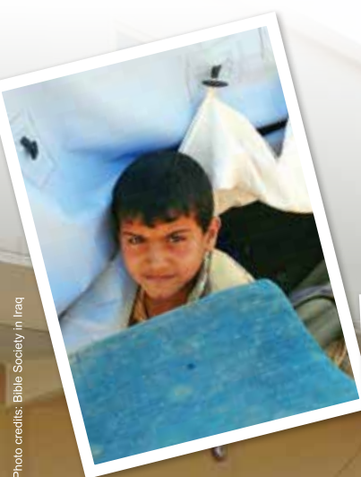
Young Iraqi Christian boy in a refugee camp 图为位年幼的基督徒孩童在帐篷里

Providing aid packages and Scriptures for refugees