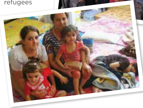
Whole families have been displaced

On behalf of those in dire distress, we appeal for your kind help to raise S$200,000 before the harsh winter comes. Please join us to respond to the cries of these people in offering not only prayers but practical help to tide them through the crisis.