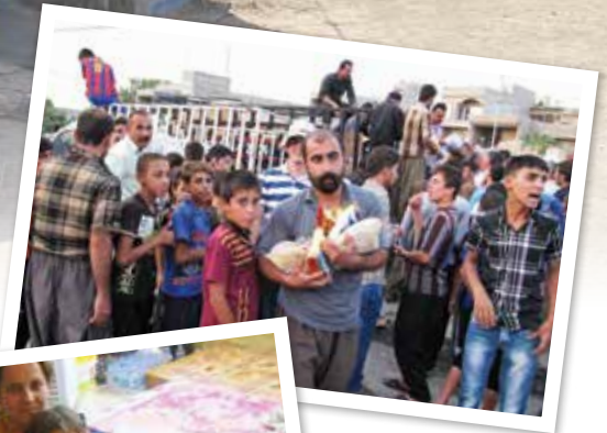
Providing relief packages and Scriptures for refugees

“Be not far from me, for trouble is near, and there is none to help...” (Psalm 22:11, ESV)